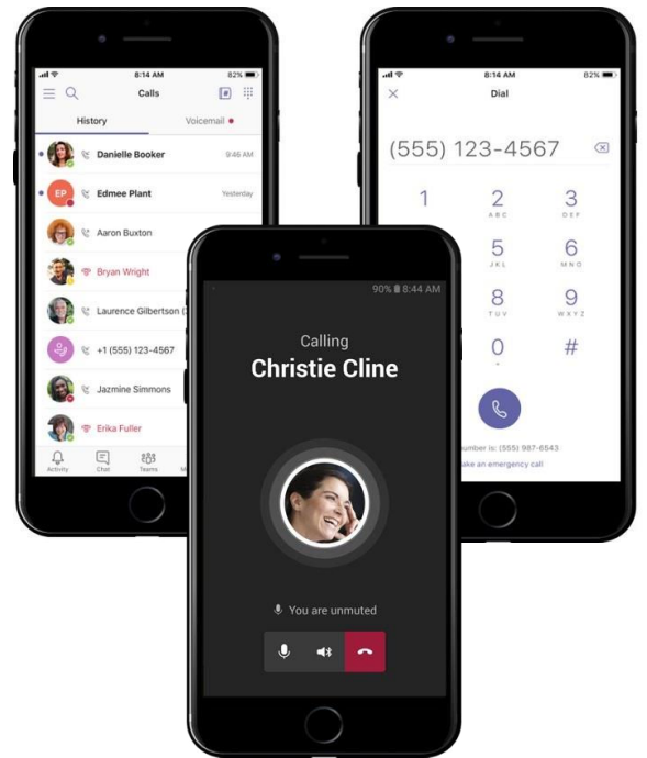
Make and receive phone calls as a native part of the Teams experience – desktop or mobile